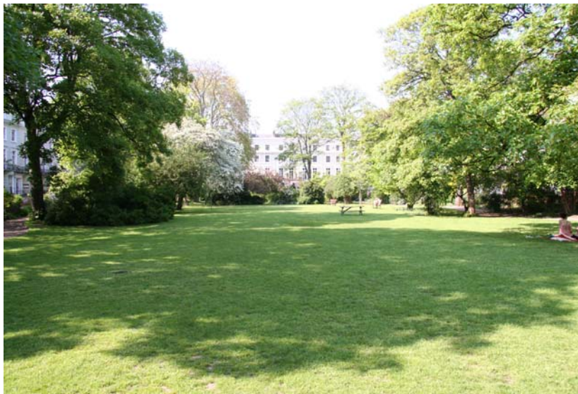
View of Norland Square, from the south, which is going through a process of enhancement while the new perimeter railings are being erected