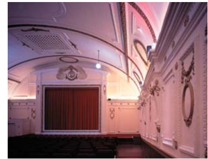
The Electric Cinema, Portobello Rd

One of the early purpose-built cinemas was the Electric in Portobello Road, which opened on Christmas Eve 1910, the name intended to express the modernity of film. It was part