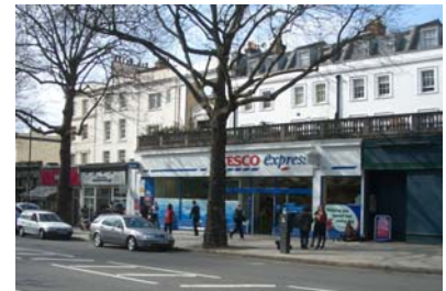
Tesco, Holland Park Avenue

The Tesco on Holland Park Avenue, though lying outside our area, has mightily concerned us in relation to its glaring design, the loading and unloading of lorries, the excessive and obstructive size of those lorries, the non-compliance of Tesco with planning conditions in relation to its Holland Park elevation, and the siting of the cash machine.