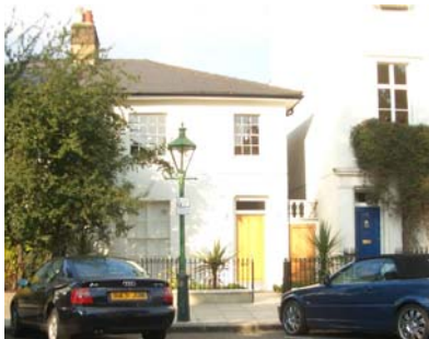
18 Addison Avenue

18 Addison Avenue is very much a case in point, with a large newly excavated area, undue extension at the rear, and a despoiled west elevation facing the architecturally unique Addison Avenue.