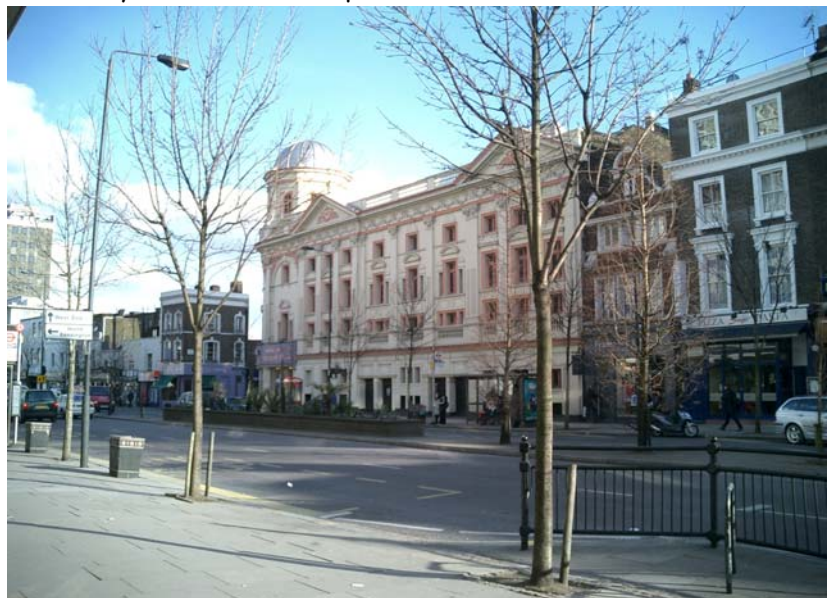
The Coronet Cinema, Notting Hill Gate, W11