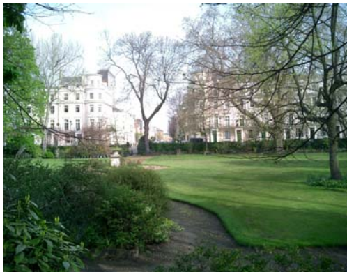
Norland Conservation Society