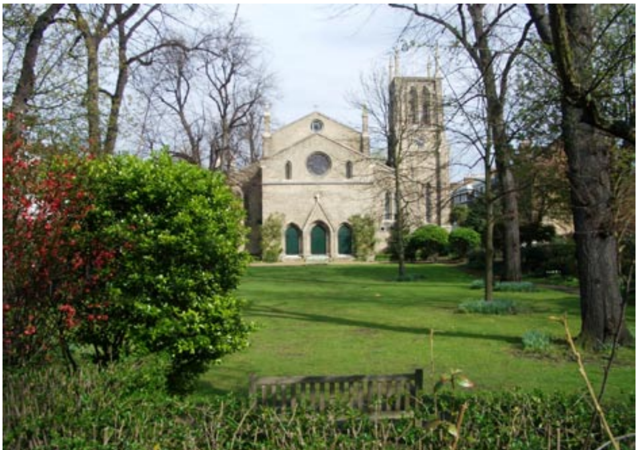
St James's Church from St James's Gardens