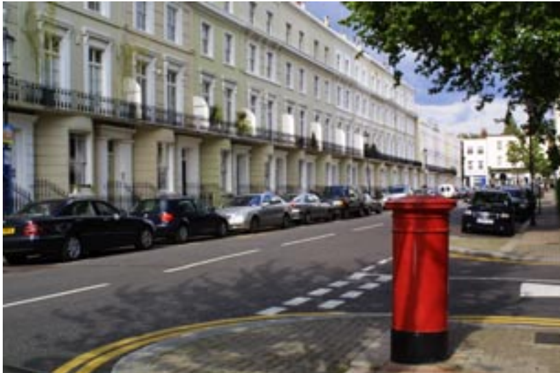
The photograph shows the east end of Queensdale Road, at the north end of Norland Square with the Prince of Wales public house (far right).