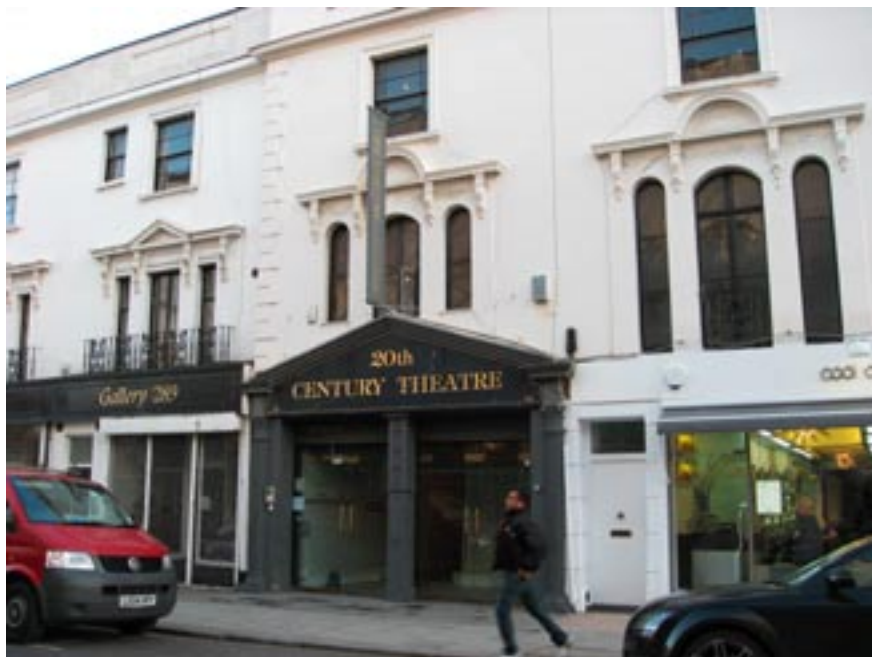
The 20th Century Theatre on Westbourne Grove, W11.