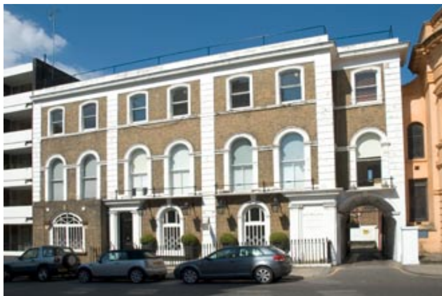
92-96 Kensington Park Road.

However, the developers have now withdrawn their appeal. They recently held discussions with RBKC’s planning staff and the Ladbroke Road Residents’ Action Committee, and we understand that they may put forward a revised proposal, under which some of the houses would be reduced to two