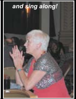
and sing along!