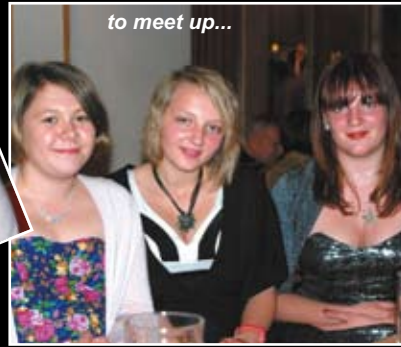
to meet up...