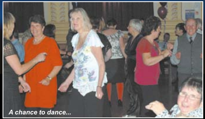
A chance to dance...