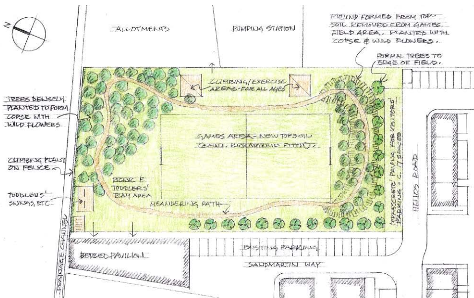
BedZED Pavilion: The Field Possible Layout, incorporating suggestions to Sept 08

As well as an exhibition of photos from the past eighteen months, there were refreshments and a chance to make suggestions for future developments, particularly relating to the development of the field as an amenity for the community. This illustration draws together the suggestions to date.